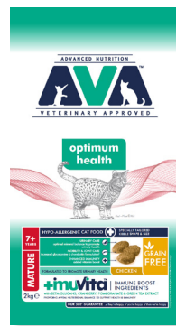
AVA Mature Cat Chicken 2kg CODE: 7120400