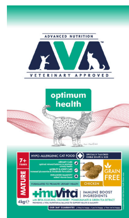
AVA Mature Cat Chicken 4kg CODE: 7120401

If you have any of these products at home please do not feed them to your cat. Instead please dispose of the contents and return the packaging to any Pets at Home store for a full refund.