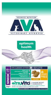
AVA Senior Cat Chicken 2kg CODE: 7120402